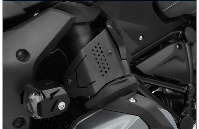
Wunderlich fuel injection system cover - left - on the BMW R 1250 R, black (Item-No.: 42940-612)