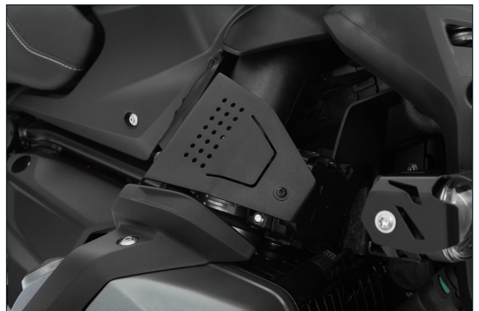
Effectively protects the components of the injection system against any mechanical stress (Item-No.: 42940-602)