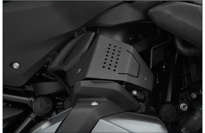
The injection system cover protects against manipulation of the system and the connectors (Item-No.: 42940-602)