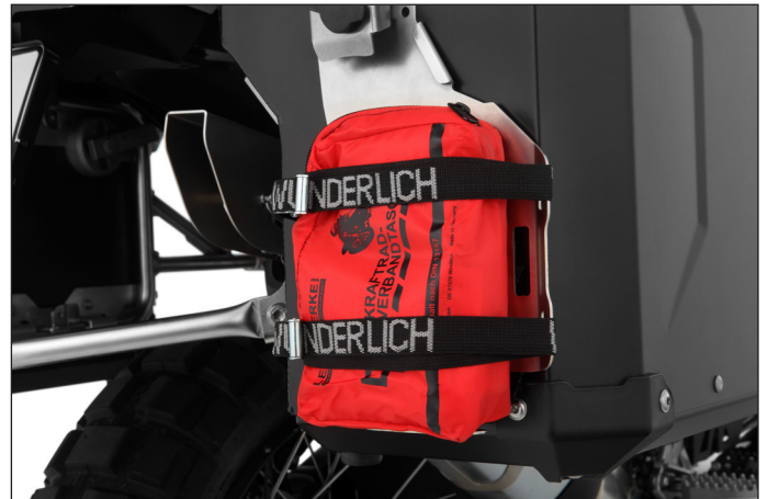
Securing is done by means of straps or expanders and the numerous lashing holes integrated in the rack