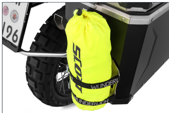
The Wunderlich case rack fits the in-house aluminium cases and top cases called EXTREME as well as the original BMW aluminium case