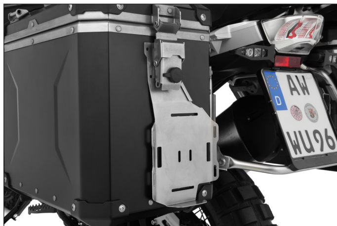
The Wunderlich case rack on BMW R 1250 GS (Item-No.: 20570-500)