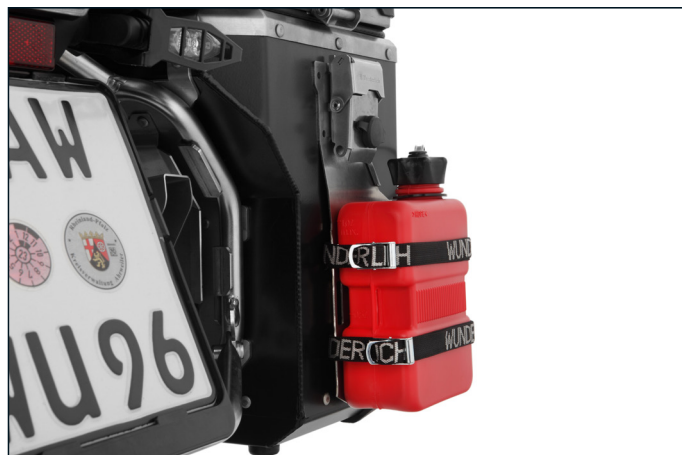
The perfect addition to the case for everything that either needs to be quickly at hand or has no business being in the case